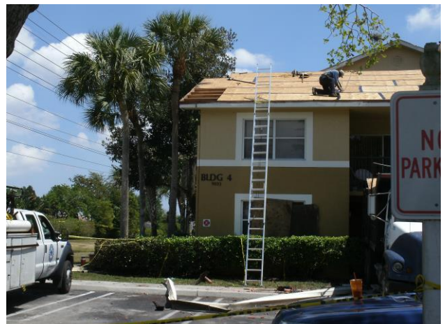
SWR INSTRALLATION - 2013