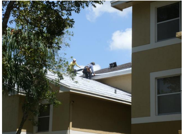
TU POLY-STICK INSTALLATION - 2013