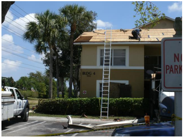
DURING TEAR OFF - 2013