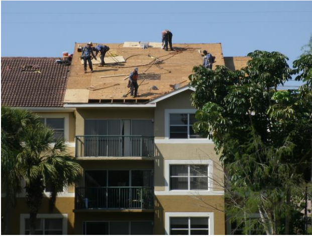
TEAR OFF OLD ROOF - 2013