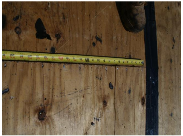
NAIL SPACING - 2013