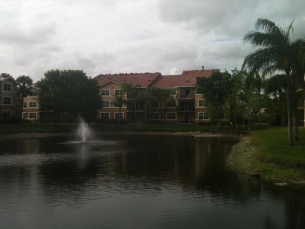
NEW TILE SET - 2013