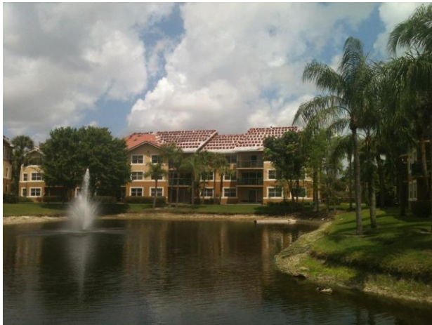
TILE LOADED FOR INSTALL - 2013