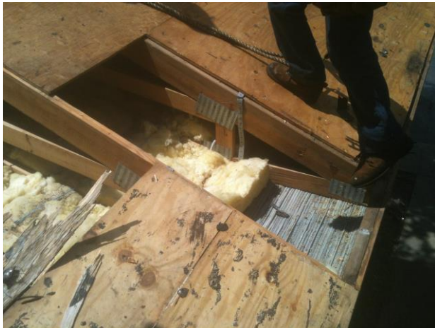
STRAP PHOTO - 2013