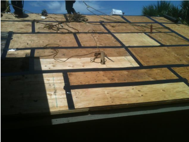
SWR INSTALLATION - 2013