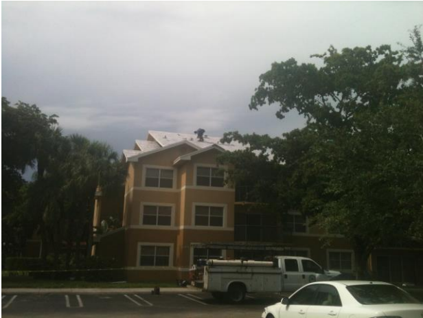
TU POLY-STICK - 2013