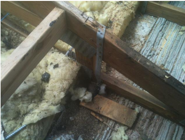
TRUSS STRAP - 2013