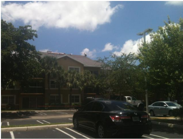
TEAR OFF IN PROGRESS - 2013