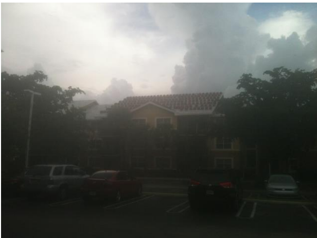
TILE LOADED ON POLY-STICK - 2013