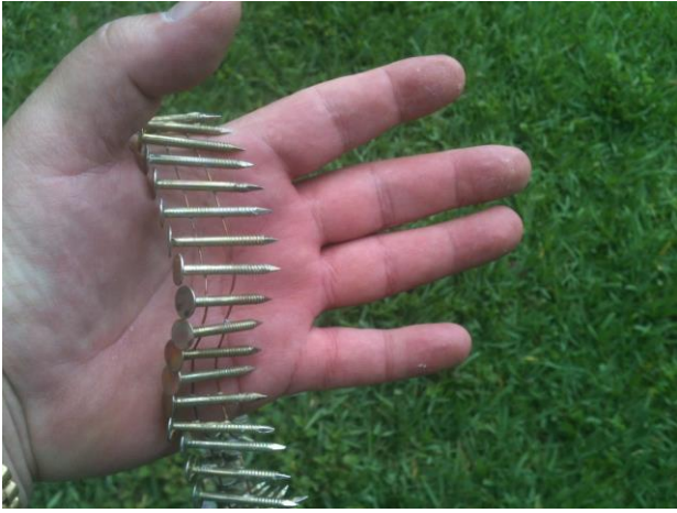
SHEATHING NAILS - 2013