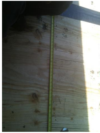
NAIL SPACING - 2013