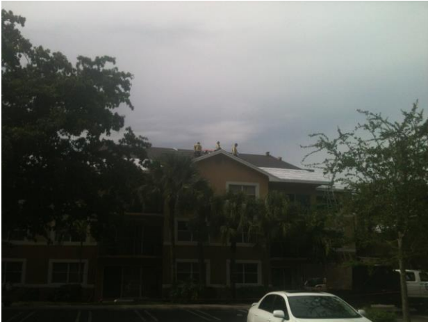
POLY-STICK - 2013