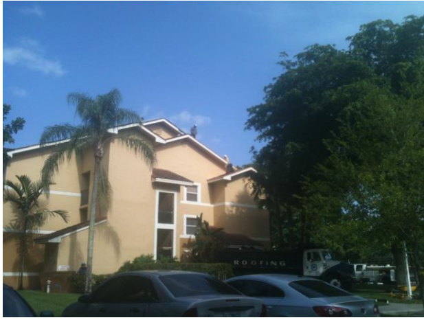
TEAR OFF OLD ROOF - 2013